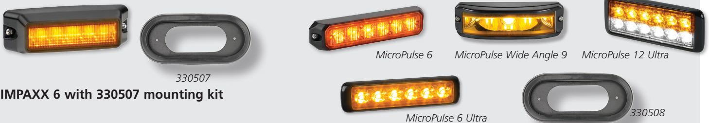
IMPAXX 6 with 330507 mounting kit

There are a variety of perimeter light alternatives available, including solutions for industry standard 6" oval applications.