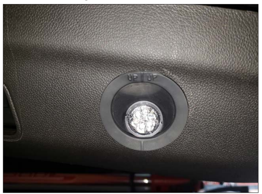
Figure 2 Grommet Position