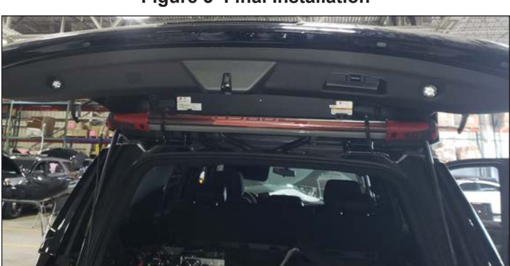
Figure 3 Final Installation

9. Test the lights for proper operation.