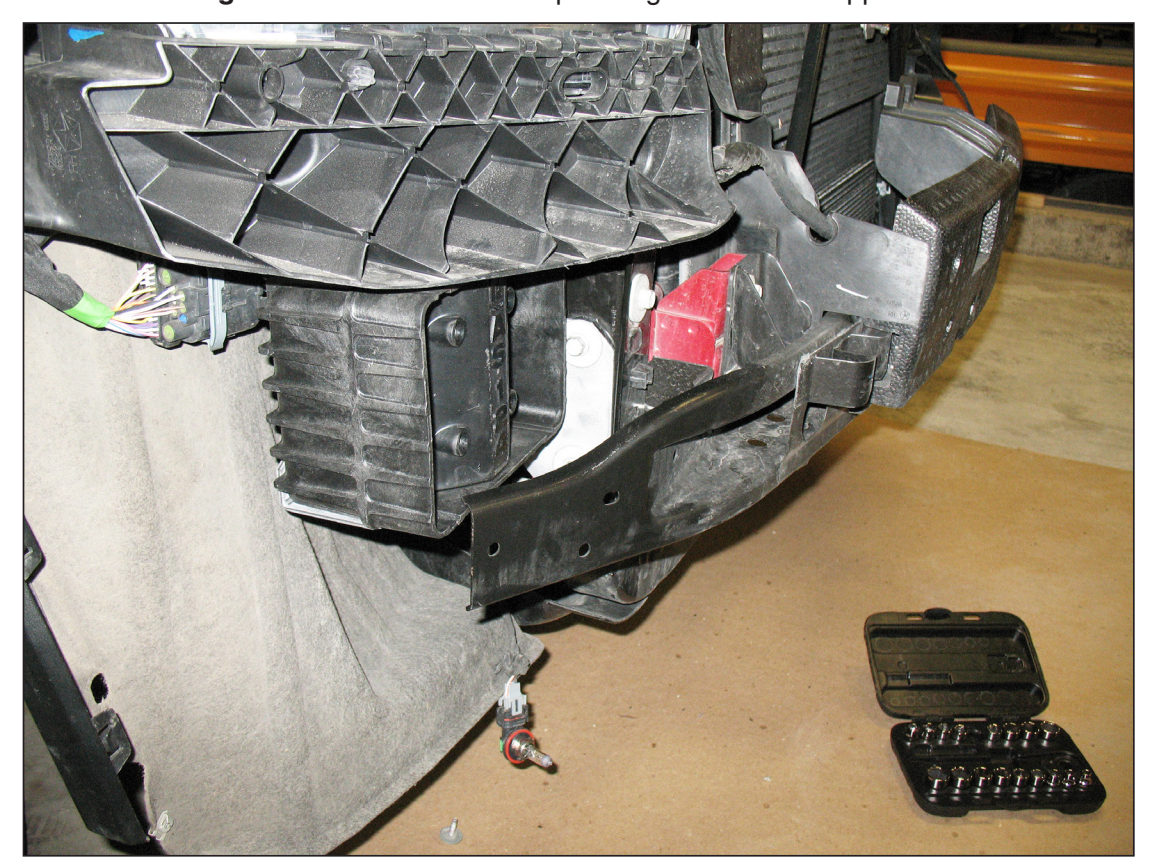
Figure 1 AS124 mounted to passenger-side core support