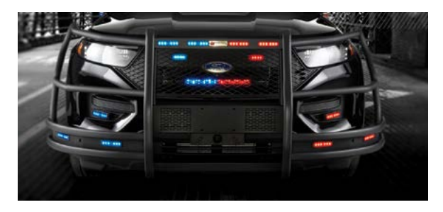
(2) ES100 speakers mounted behind the center bar of the DFC push bumper on a Ford Police Interceptor Utility

ESBMT-SB Bumper/surface mount ESFMT-EFB Flush mount, Black grille