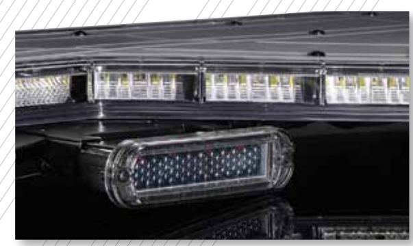
Opticom emitter is available as an option for select Federal Signal light bars.