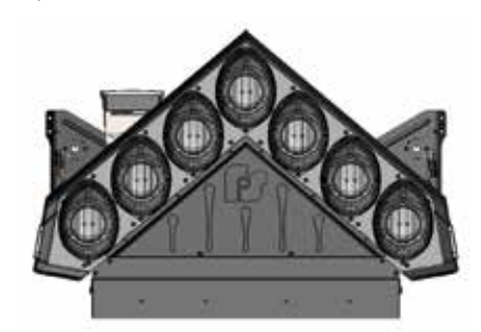
795H-EXTB-D shown on Vision SLR