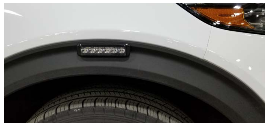
Figure 3 Installation complete

12. Repeat steps 1-11 for the other three wheel well locations.