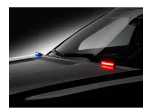
MPS650-BB and MPS650-RR Mounted on Hood