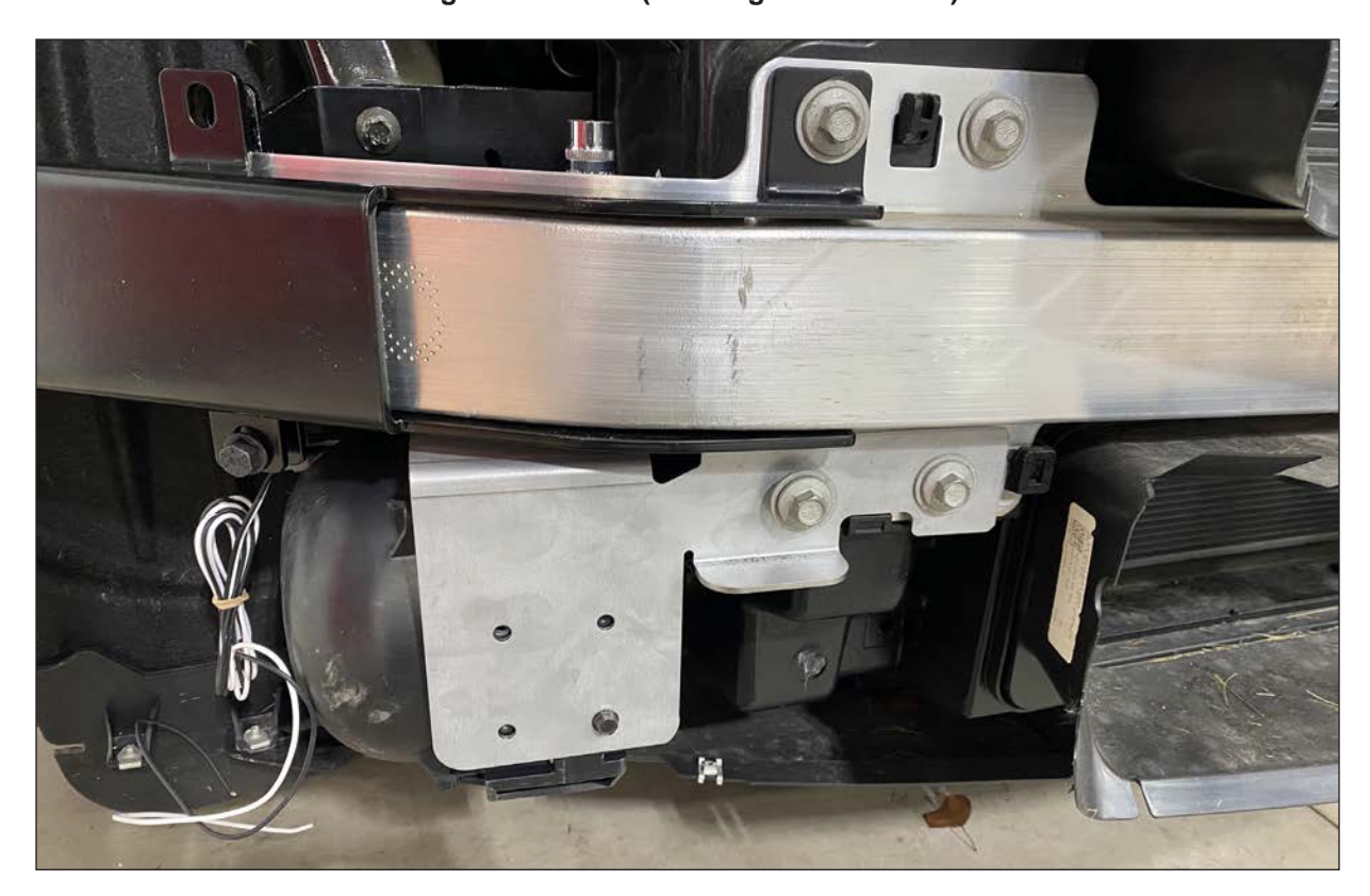
Figure 3 Bracket (Passenger side shown)

NOTE: When mounting the driver side bracket, relocate the rubber harness mount found behind the driver side bumper.