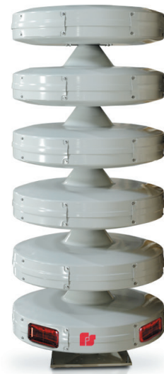
Shown with optional QuadraFlare lights