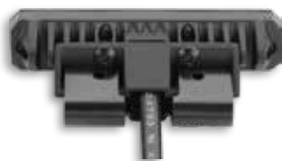
MPS650/MPS652 Grille/Hood Mount Model