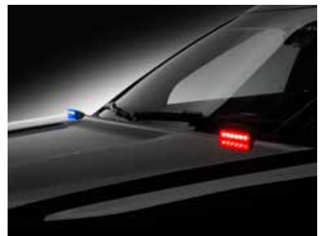
MPS650-BB and MPS650-RR Mounted on Hood