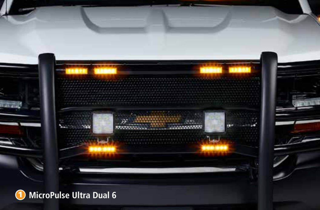
① MicroPulse Ultra Dual 6