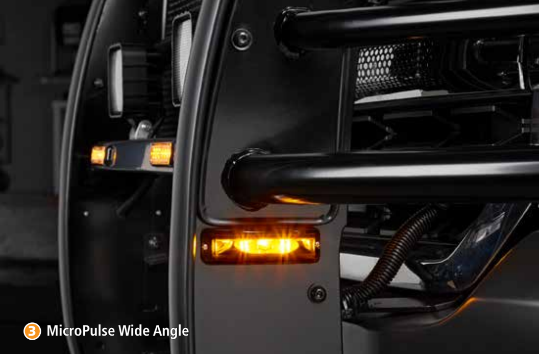
③ MicroPulse Wide Angle