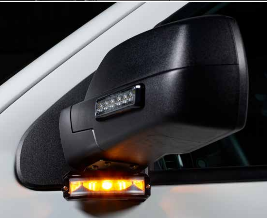
④ MicroPulse Wide Angle