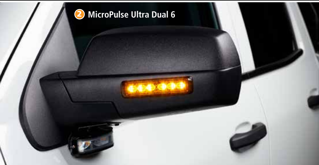
② MicroPulse Ultra Dual 6

(9) powerful LEDs providing a 180-degree light spread