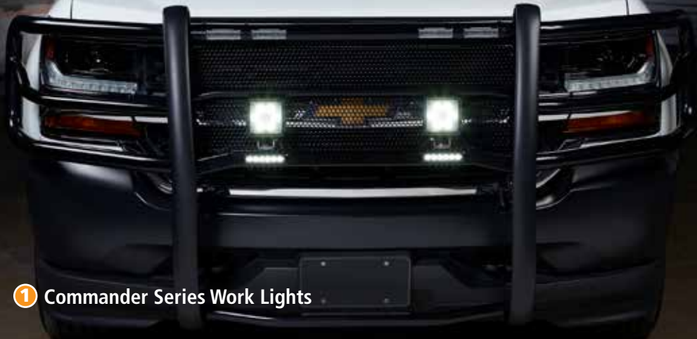
① Commander Series Work Lights