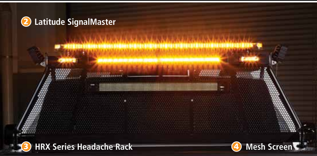
② Latitude SignalMaster

Left, Right and Center-out directional light available in 6- or 8-head models