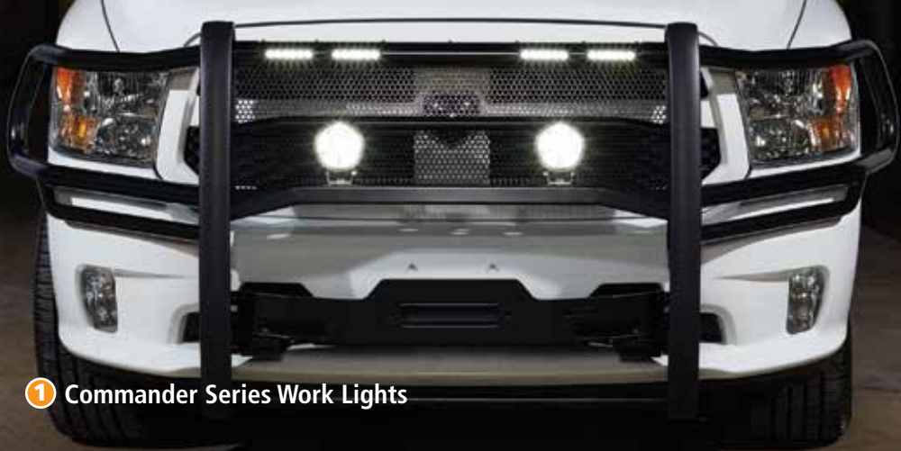
① Commander Series Work Lights