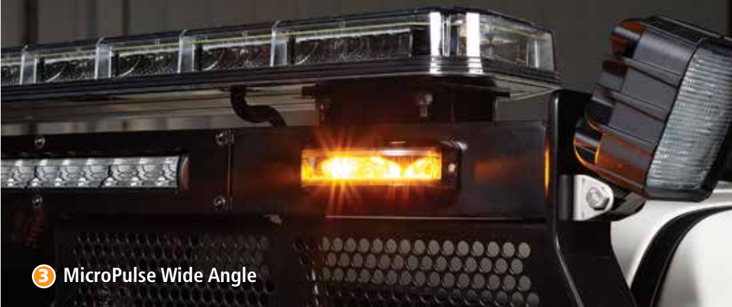
3 MicroPulse Wide Angle