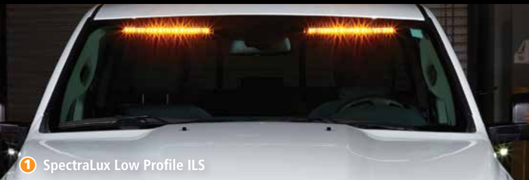
① SpectraLux Low Profile ILS

Low profile internal lighting system available in single, dual or three-color lightheads