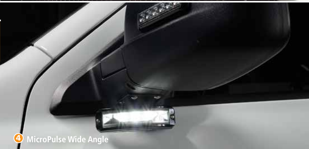
4 MicroPulse Wide Angle