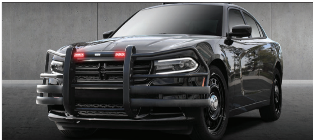
Push Bumper, Top Channel, Pit Bar and Wing Wrap shown installed on a Dodge Charger

*PBX Series products are Federal Signal Price Group M35